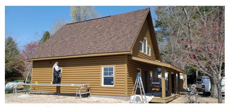
The new Balmy Heights is almost complete

Balmy Heights. The most noticeable improvement is replacing the A-frame Balmy Heights with a more traditional cabin with straight-sided walls. This project started in the fall and is scheduled to be finished in late spring. Hitting your head on the beams of the A-frame is now a thing of the past.