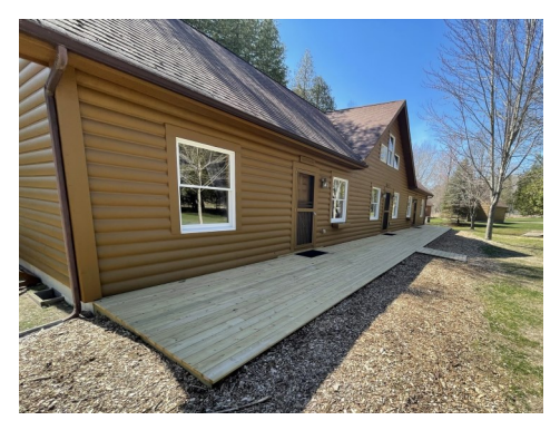
The Triplex freshly stained with its new deck

ed by a local painting company from Manistee. Last fall and this spring, camp volunteers stained/will stain Maplewood, Room-4-U, Sunset, Twin Oaks East and West cabins.