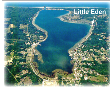
Beautiful Portage Lake!

From Onekama, take M22 north to Portage Point Drive, then west ½ mile to Little Eden Camp.